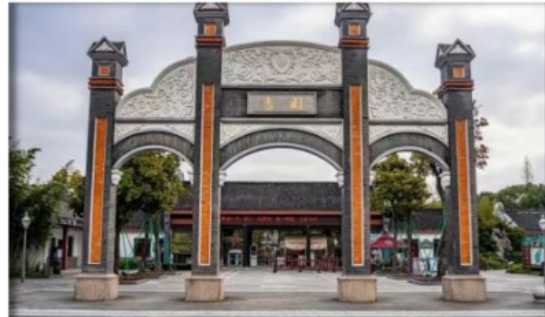
南通植物园 Nantong Botanical Garden