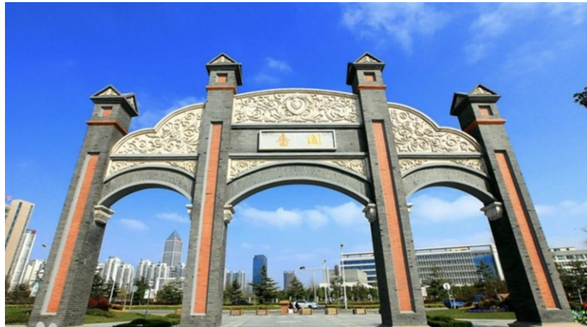
南通啬园 Nantong Seyuan