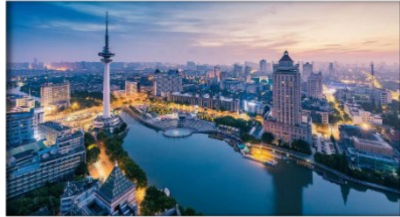
濠河风景区 Haohe Scenic Spot