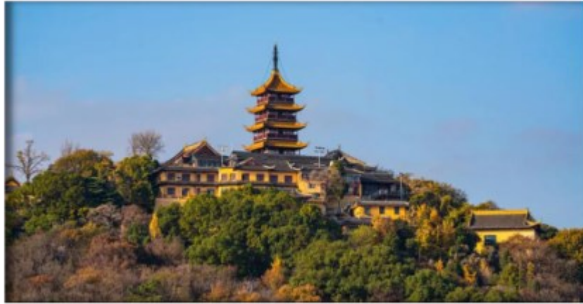
狼山风景区 Langshan Scenic Spot